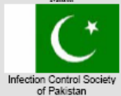
Infection Control Society of Pakistan