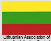
Lithuanian Association of Hospital Infection Control