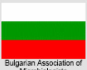
Bulgarian Association of Microbiologists