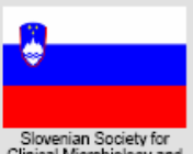
Slovenian Society for Clinical Microbiology and Hospital Infection