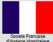
Societe Francaise d'Hygiene Hospitaliere