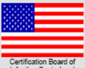
Certification Board of Infection Control and Epidemiology Inc. (CICE)