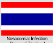
Nosocomial Infection Group of Thailand