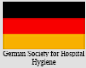
German Society for Hospital Hygiene