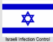
Israeli Infection Control Nurses Association