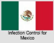
Infection Control for Mexico