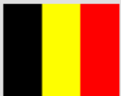
Association Belge pour l'Hygiene Hospitaliere