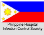
Philippine Hospital Infection Control Society