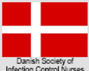
Danish Society of Infection Control Nurses