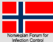
Norwegian Forum for Infection Control