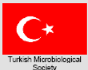
Turkish Microbiological Society