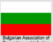
Bulgarian Association of Prevention and Infection Control (BuINoso)