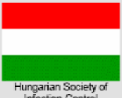
Hungarian Society of Infection Control Practitioners