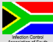
Infection Control Association of South Africa