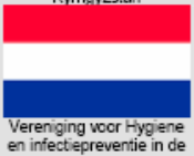
Vereeniging voor Hygiene en infectiepreventie in de Gezondheidszorg (VHIG)