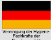
Vereinigung der Hygiene-Fachkräfte der Bundesrepublik Deutschland