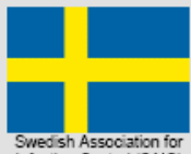
Swedish Association for Infection Control (SAIC)