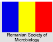
Romanian Society of Microbiology