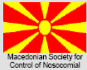
Macedonian Society for Control of Nosocomial Infection