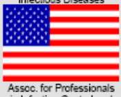
Assoc. for Professionals in Infection Control and Epidemiology (APIC)