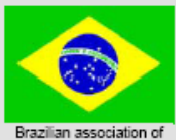
Brazilian association of infection control and hospital epidemiology