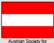
Austrian Society for Hygiene, Microbiology & Preventive Medicine (OGHMP)