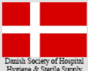
Danish Society of Hospital Hygiene & Sterile Supply