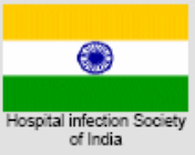
Hospital Infection Society of India