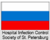
Hospital Infection Control Society of St. Petersburg