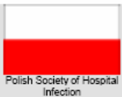
Polish Society of Hospital Infection