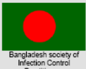
Bangladesh society of Infection Control Practitioners