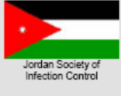
Jordan Society of Infection Control