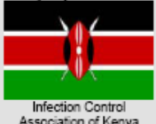
Infection Control Association of Kenya