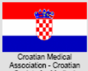
Croatian Medical Association - Croatian Society for Medical Microbiology and Parasitology